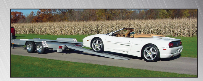
TRAILER SPECIFICATIONS (ALL MODELS AVAILABLE WITH SURGE OR ELECTRIC BRAKES)