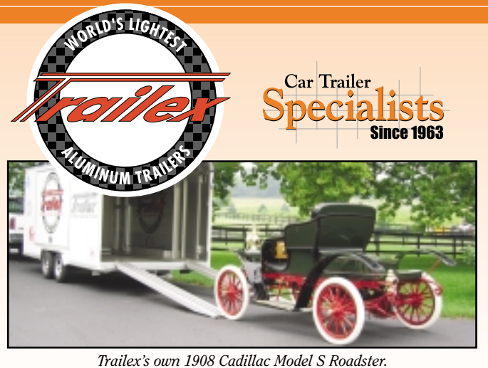
1st Junior, Senior, Grand National, Grand National National Winner only travels in a Trailex Trailer.