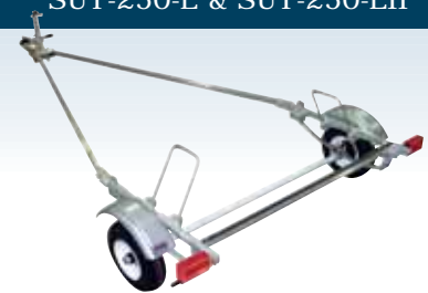
SUT-250-L & SUT-250-LII

These trailers are specifically designed to carry the Laser I and II or Byte sail boat. Boats are supported at 3 points under the bow and gunwale eliminating hull stress points. One person can load or off load using the optional swivel bow support.