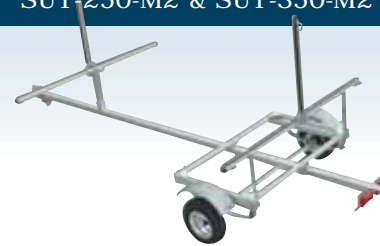
SUT-250-M2 & SUT-350-M2

For the person who has more than 1 canoe, kayak or small boat. Choose our 250 lb. or 350 lb. capacity model that holds 2 canoes or up to 4 kayaks. Also has standard adjustable crossbars with vinyl extrusions for that cushioned ride. Trailer has 6 tie down loops standard and as always the axle can be adjusted.