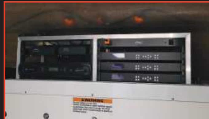
Easily accessible equipment rack