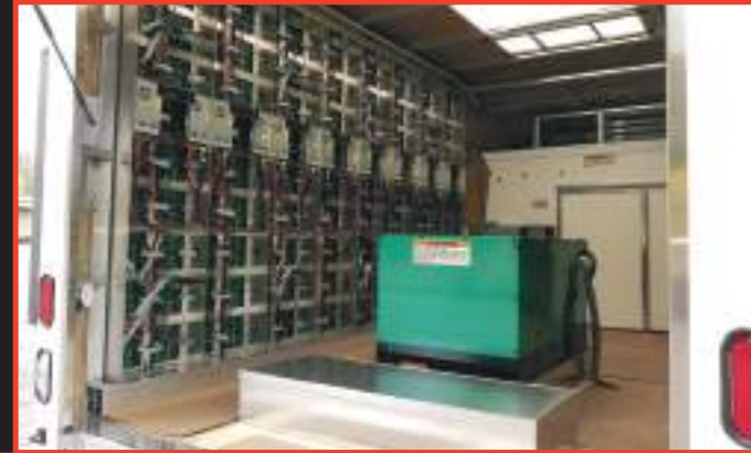
A clean, simple design with easy access to modules and wiring.