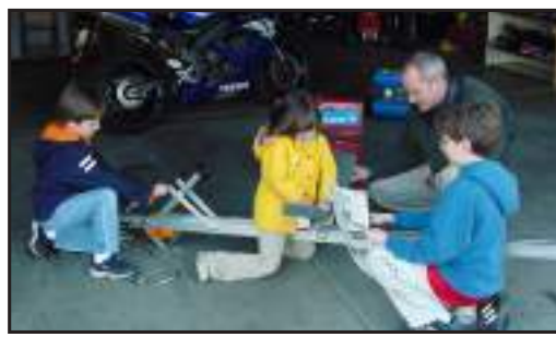
Instructional sheets are available to download at: