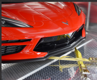
Front Tie Down