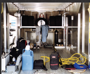
Race Prepared Options