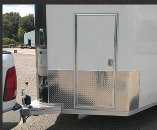
Aluminum Stone Guard