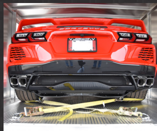
Back Tie Down