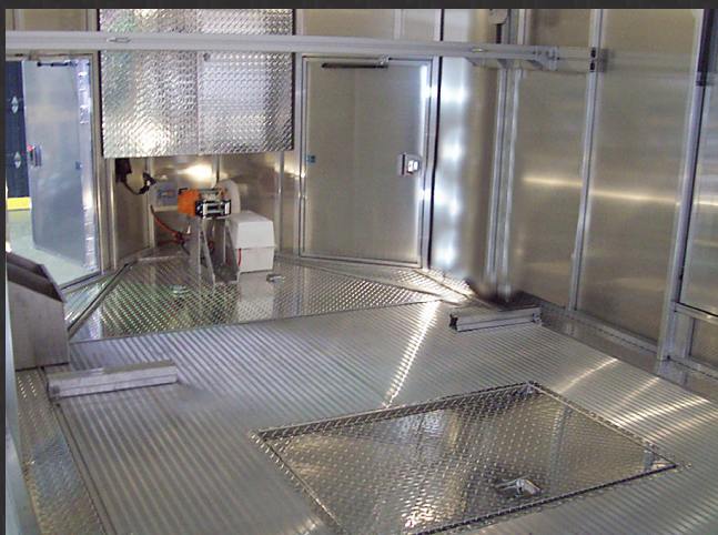
Front Cabinet, Floor Box, Electric Winch w/ Battery

CUSTOM-BUILT FOR YOUR NEEDS AND YOUR CAR'S DIMENSIONS