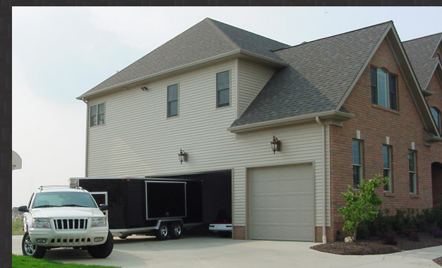
Fits in 7' Garage Door