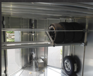
Internal Tire Rack