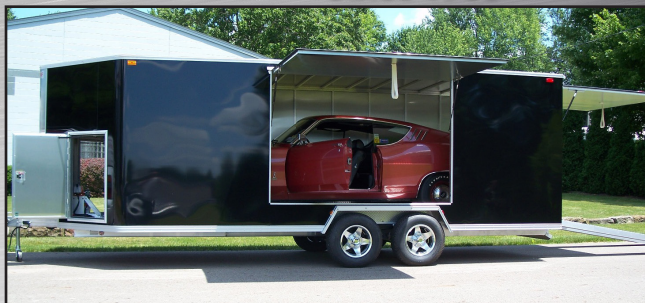
Standard Side Door - Industry Exclusive