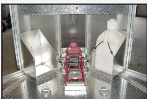
Fuel Jug and Jack Storage