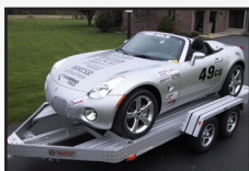
Open Car Trailers