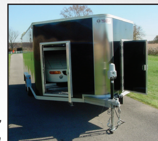
Exclusive "Aero" Front Design