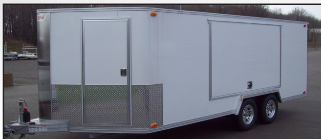
Front Aluminum Diamond Plate Guard

CAN BE CUSTOM BUILT SPECIFICALLY FOR YOUR CARS DIMENSIONS