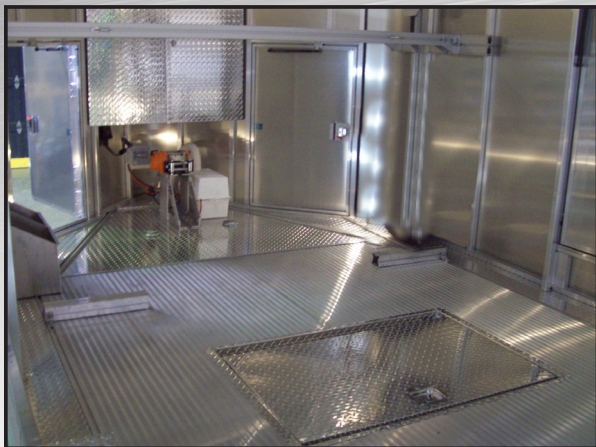
Front Cabinet, Floor Box, Electric Winch w/ Battery