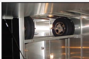
Internal Tire Rack