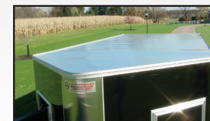
One Piece Aluminum Roof