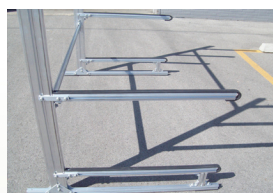
36" Arm assembly for wall rack