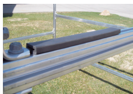
Vinyl crossbar option for 3 and 4 boat rack