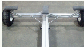
Inflatable kit option