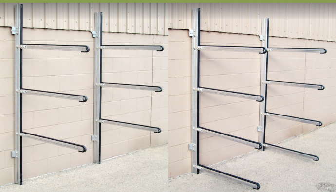
Model SUT-WR4 4 boat wall rack