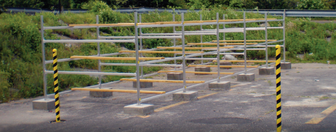
Model SUT-3BR shown with SUT-3BRE Extensions linked