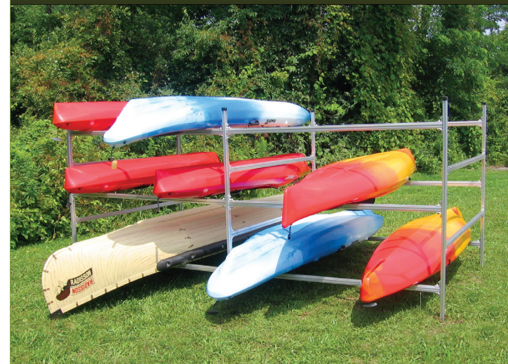
Model SUT-3BR shown with SUT-3BRE Extensions linked

THE CANOE/KAYAK BOAT RACKS LIKE NO OTHER