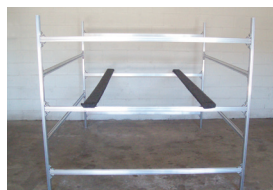
Wood bunks for 3 and 4 boat racks (1 set)