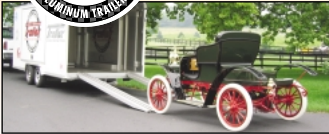
Traillex's own 1908 Cadillac Model S Roadster. 1st Junior, Senior, Grand National, Grand National Winner only travels in a Traillex Trailer.