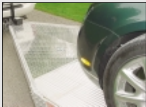
Diamond Plate Front Floor